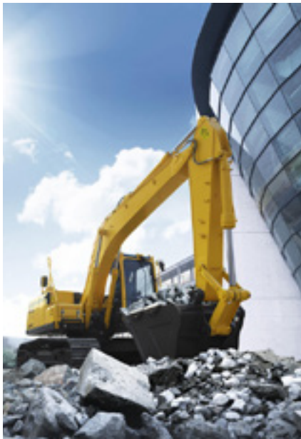
工程机械 Engineering machinery