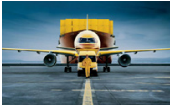
物流、港口机械 Logistics, port machinery