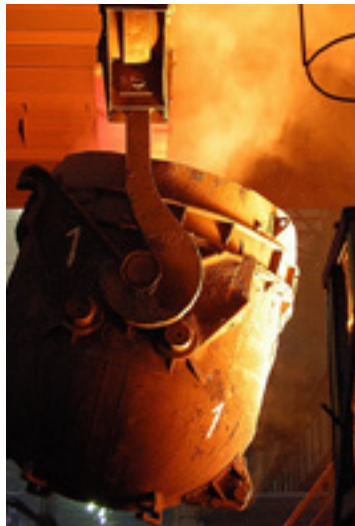
冶金行业 Metallurgical Industry