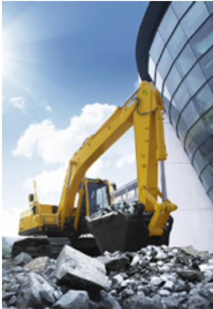
工程机械 Engineering machinery